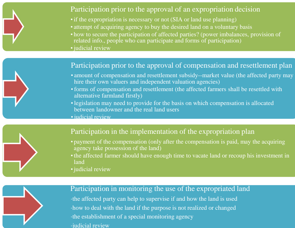
Figure 1 The international model of a well-governed land expropriation system